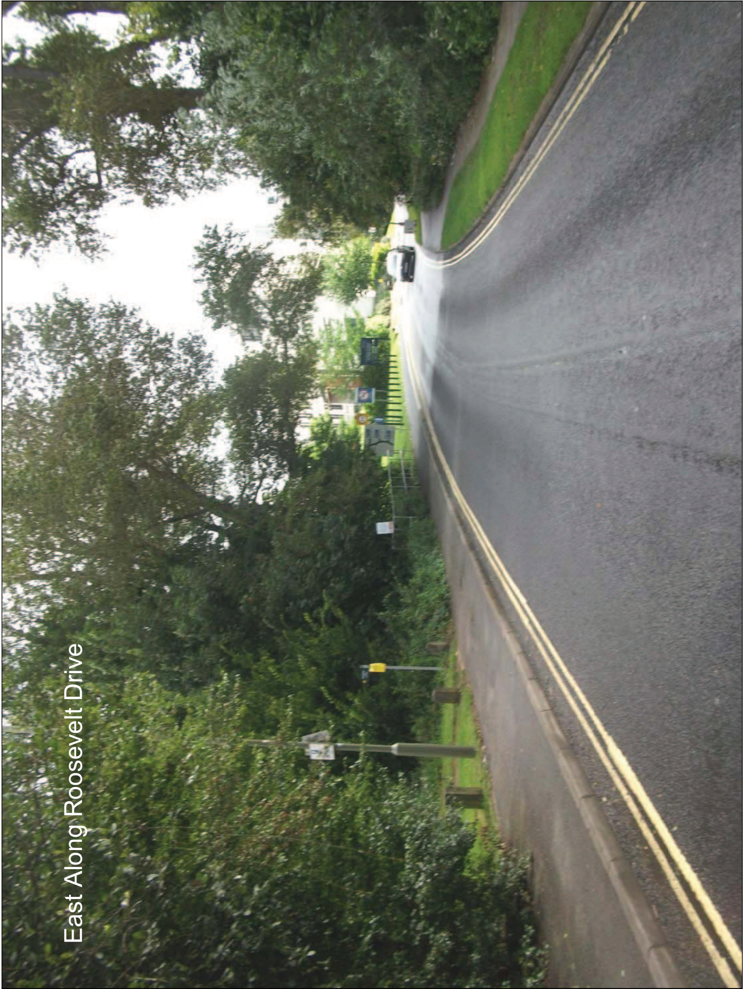
East Along Roosevelt Drive